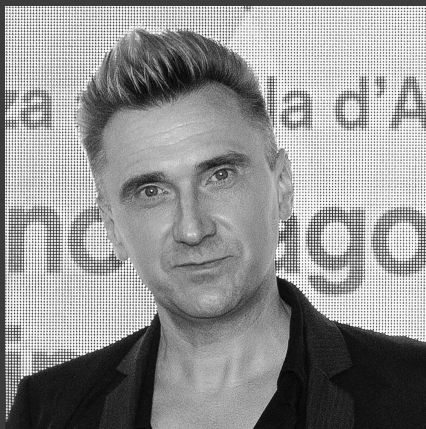
Stefano Cagol - Italy Curator and Artist

Stefano Cagol (Italy, 1969), Italian contemporary artist based in the Alps, is the curator of WE ARE THE FLOOD .